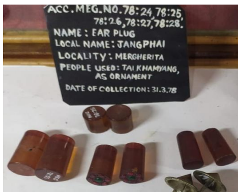
Figure 6.6- Amber Earplugs 'Kenhoo' (Old)

Change was seen even in the case of ornaments. Earlier the Tai Khamyang women used to wear ear logs known as Kenhoo made of Amber. Gradually the Kenhoo changed form and it was made with gold and other precious metals. Traditional ornaments are generally worn by the womenfolk only during religious festivities or rituals like marriage. Tai Khamyang men also don't use ear logs these days. The youth also feel pride in wearing the traditional dresses during religious festivals as well as cultural programmes. The traditional Tai Khamyang ornaments are also not easily available these days. Figure 6.6 shows traditional amber earplugs ( Kenhoo ) which were worn by both women and men. Figure 6.7 shows the present day ear plugs which are mainly made of gold, gem set and enamel and it is very much influenced by the Assamese ear ornament Thuriya .