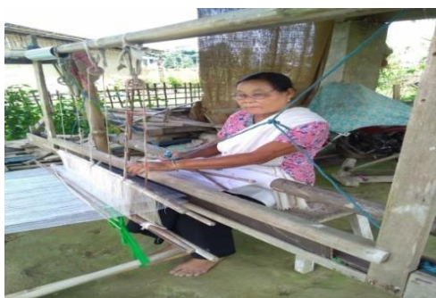
Figure 6.9- Traditional loom Key Hok