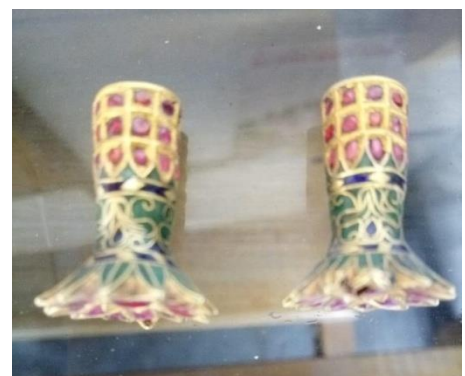
Figure 6.7- Earplugs 'Kenhoo' (New)