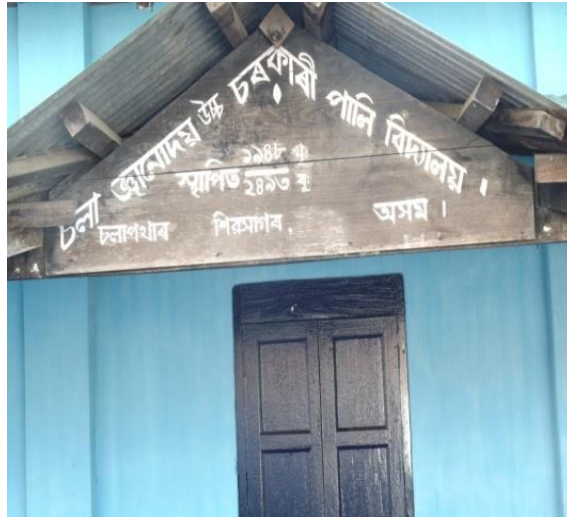
Figure 6.2- Pali School in Chalapather Shyam Gaon

it was the common language of understanding. Pali language is very popular among the Tai Khamyangs of Assam mainly for religious reason. The Tai Khamyangs are Buddhists and as most of the Buddhist scriptures are written in Pali language, it is also being taught to the youths. There is a Pali School in Chalapather Shyam Gaon which was established as early as 1948 A.D.