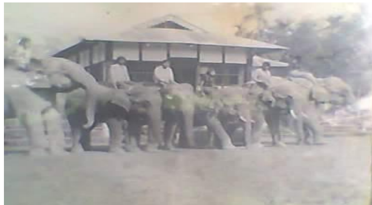
Figure 6.8- Old photo (early 1980's) showing Elephant rearing in Rohon Shyam Gaon