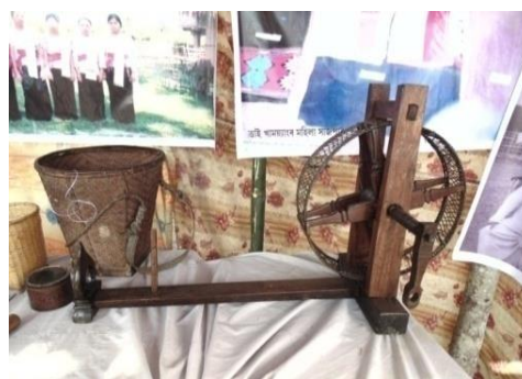
Figure 6.10- Traditional spinning wheel Kong